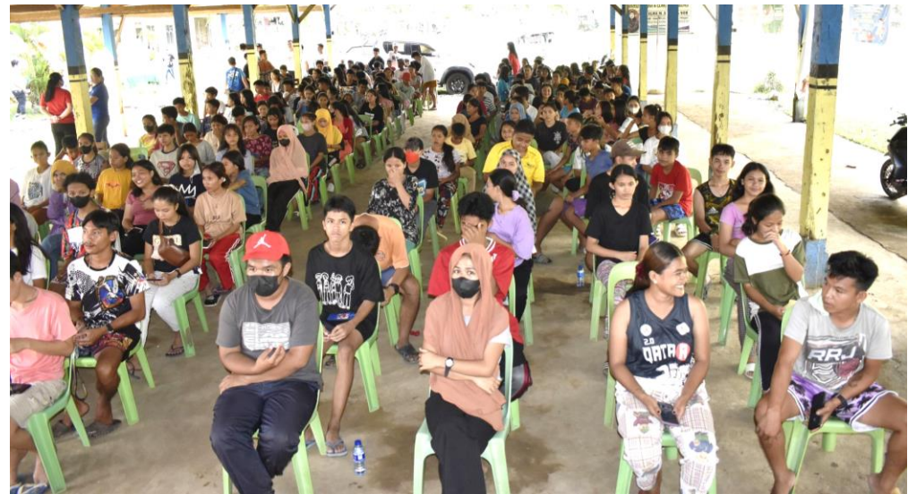
Turnover of donations to the flood victims in BARMM in partnership with Triumph Motorcycle Inc.. Nov. 6, 2022